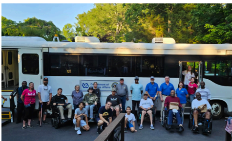
Richmond, VA retreat

"Thank you to VAU and all its generous donors for providing me this incredible bike to train and exercise. It has been instrumental for my mind and body."